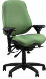
J2507 - Standard