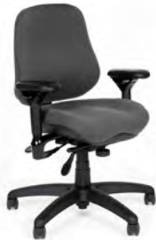
J2407 - Compact