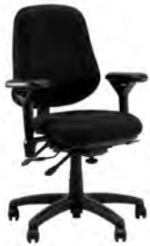
J2406 - Petite