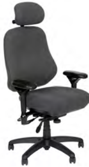
J3509 - Executive