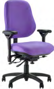
J2509 - Stretch Back