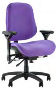
J2504 - Large Seat

Questions contact: Customer Service at 651.289.9159