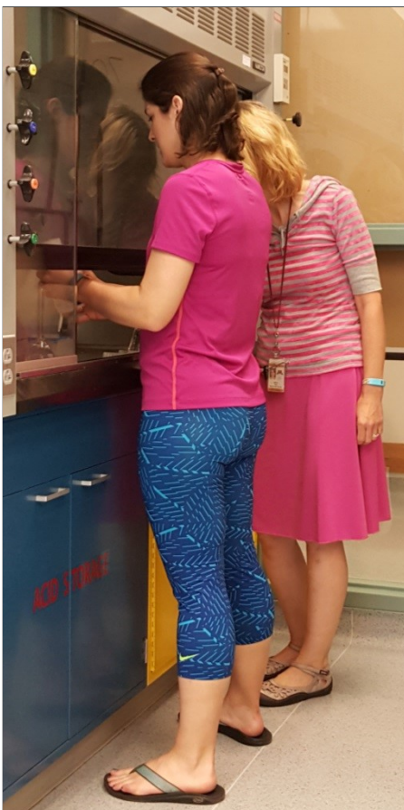
Figure 1: Unacceptable attire. Short pants or skirts and sandals, open shoes, ballet flats or shoes with cut-outs.