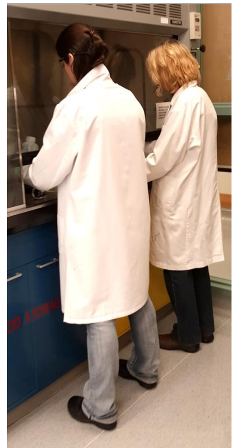
Figure 3: High hazard attire. Some departments require extra PPE, such as lab coats, to enter the lab. Also, some lab work may require the use of additional PPE.