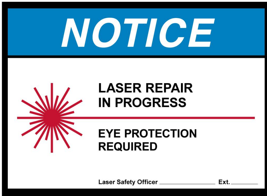
Fig. 4. Signage used when a laser or laser system is undergoing maintenance. Often displayed when a normally enclosed laser system is undergoing repair or maintenance and safety interlocks, protective panels, etc. are removed allowing for the possibility of laser radiation exposure.