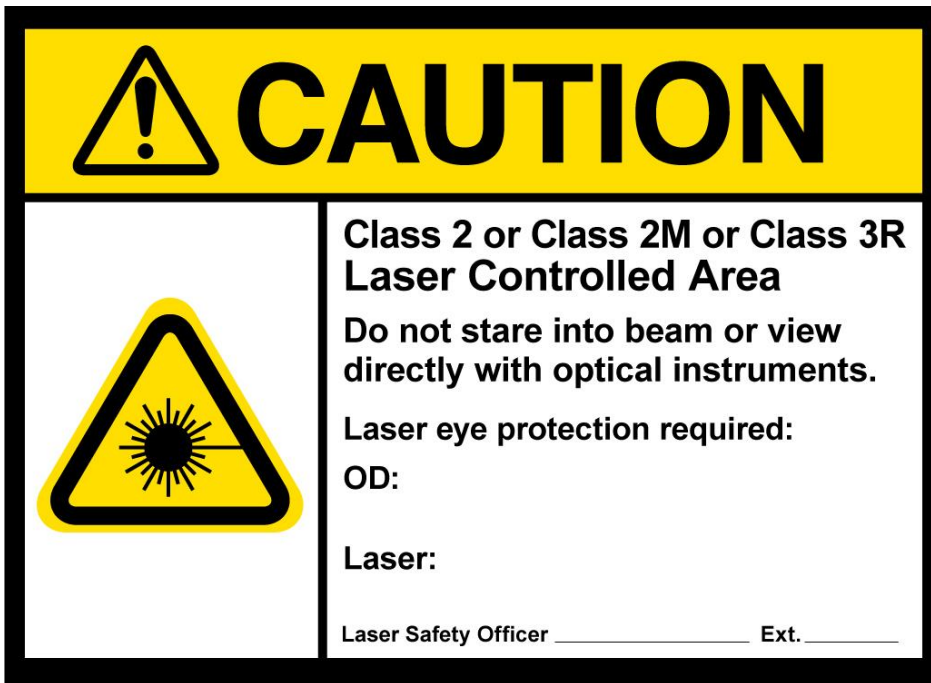
Fig. 3. Recommended (but not required) for areas containing Class 2, 2M or 3R lasers or laser systems.