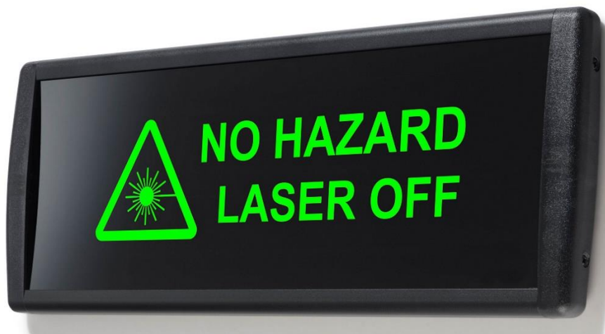
Fig 5. Example of a lighted sign operated either manually or automatically when laser system is activated.