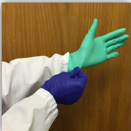
Figure 1: Grip one glove near your wrist.