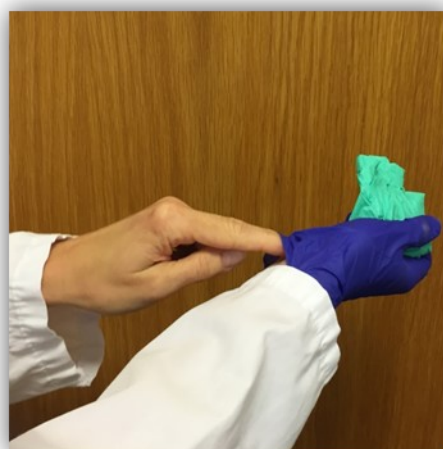
Figure 4: Slide your finger under your 2nd glove, still gripping the 1st glove.