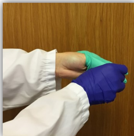
Figure 2: As you pull the glove over your fingers, the glove will be pulled inside-out.