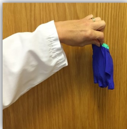
Figure 6: The 1st glove will be contained within the 2nd glove. Dispose appropriately.