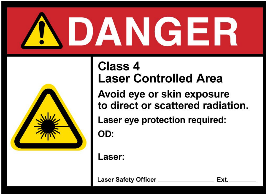
Fig. 1. Laser sign for Class 4 lasers (multi-kilowatt). Reserved for lasers that may inflict severe or fatal injuries if bodily exposure occurs.

Areas in which Class 3B or Class 4 lasers or laser systems are used must post signage warning people of the potential hazards. It is the responsibility of the laboratory to acquire and maintain proper signage. At a minimum, the sign layout and wording must detail the highest-class laser contained within the area. Additional signs for lower-class lasers may also be displayed. These signs must comply with ANSI Z535 series (e.g., ANSI Z535.2: Environmental and Facility Safety Signs) and ANSI Z136.1, Safe Use of Lasers . Examples of laser warning signs are shown below.